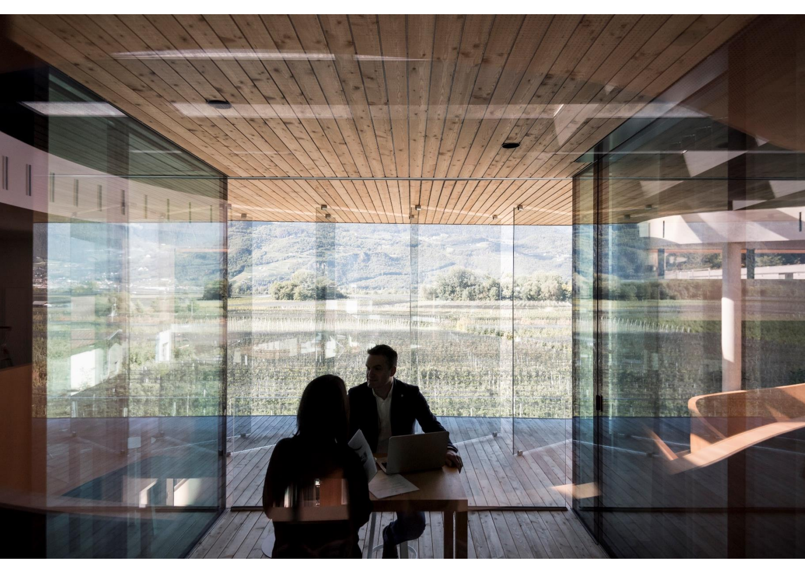
Dr. Schär AG/SPA Postal, Italy, January 2023